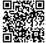
Trinity Church Kailua General Fund https://www.trinitychurchkailua.org