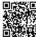
Trinity Church Kailua General Fund https://www.givingwith.org

The offering has always been part of God's worship. Our gracious God has lavished upon us His grace in Jesus. His grace is the action. Our giving is the reaction to grace. A financial response is only one of many responses to God's grace. We give because we are discovering the treasure of the kingdom and the King!